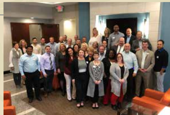
The First Bank Mentorship Program, Class of 2018.

to foster collaboration, positivity, and leadership building. In keeping with First Bank's culture of developing leaders, creating opportunities, and promoting from within, a valued First Bank